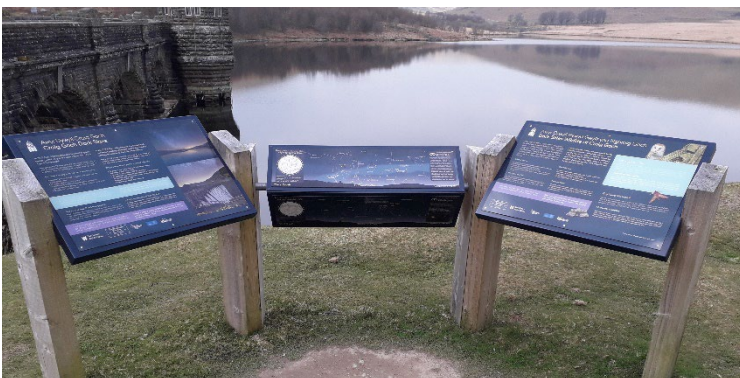
Dark Skies Interpretation

Examples of new waymarking for routes from Claerwen and Penbont hubs