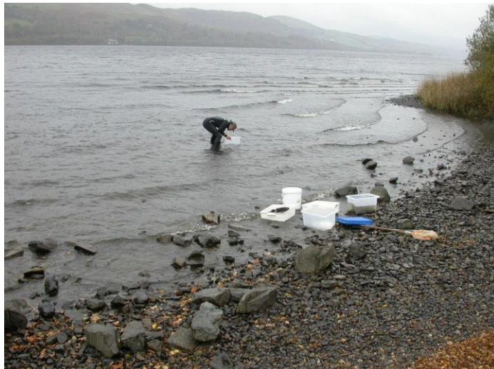
Figure 12: Ian Hughes gathering Myxas glutinosa at Site 6 for captive study.