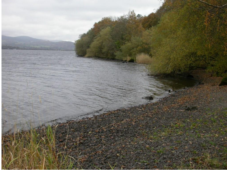
Figure 5: Monitoring Site 2.