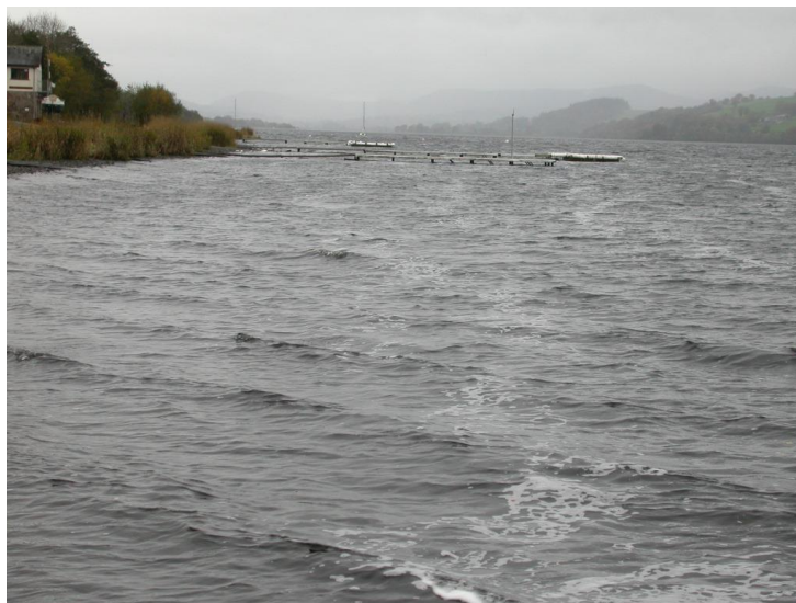
Figure 4: Myxas glutinosa monitoring Site 1 showing 'choppy' lake surface during survey conditions on 27 th October 2014.