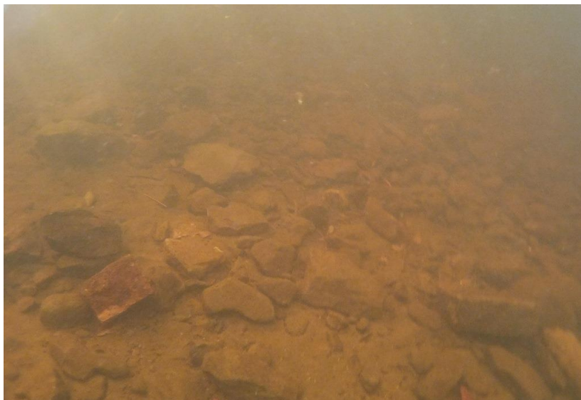
Figure 15: Under water Myxas habitat in lake shallows of Llyn Tegid.