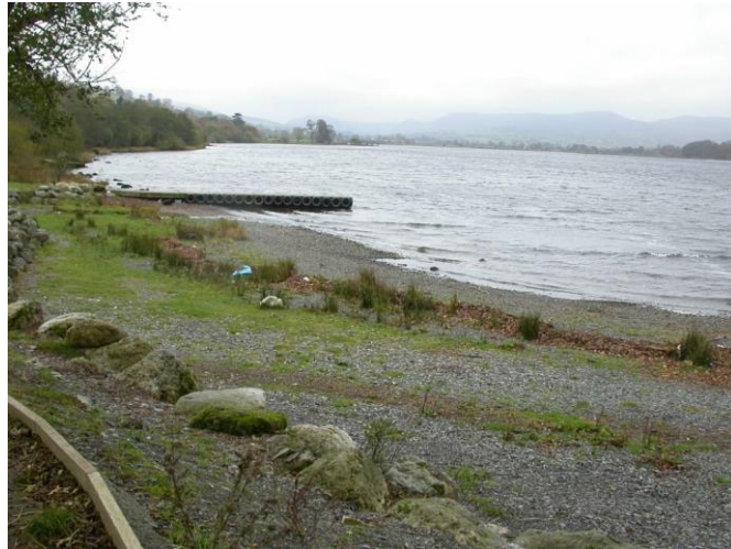
Figure 6: Monitoring Site 3.