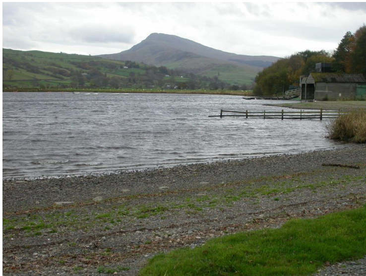
Figure 9: Monitoring Site 7.