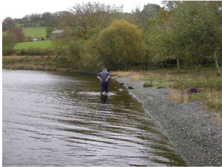
Figure 11: Monitoring Site 11 in October 2014.