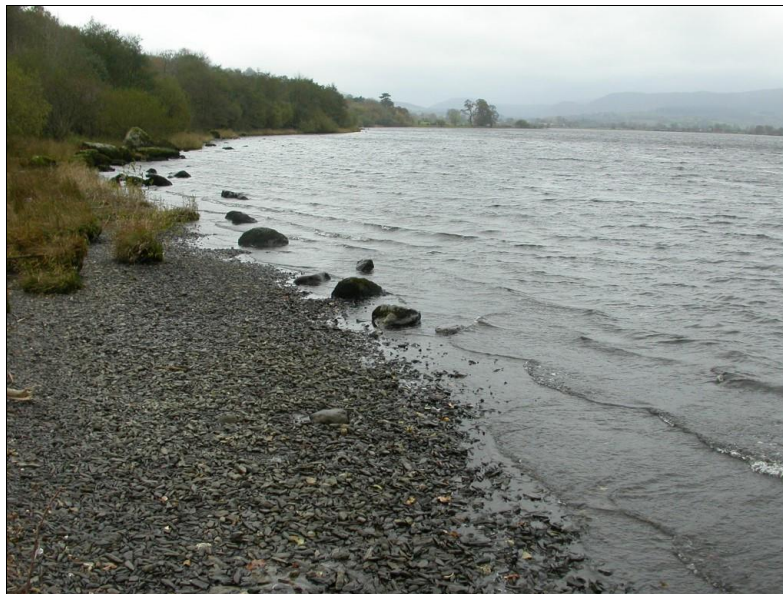
Figure 1: Monitoring Site 3 (looking south).

A study supported by Natural Resources Wales & Freshwater Habitats Trust