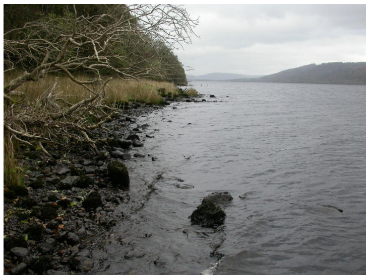
Figure 10: Monitoring Site 9.