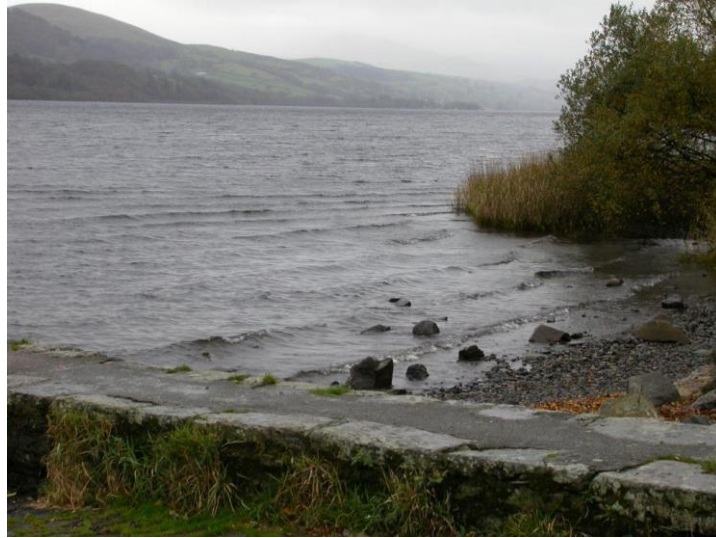
Figure 8: Monitoring Site 6.