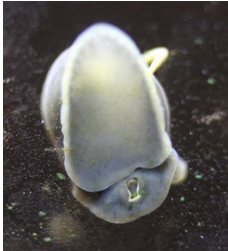
Figure 14: Captive Myxas grazing on algae.