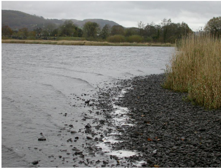
Figure 3: Myxas glutinosa monitoring Site 1 in October 2014.